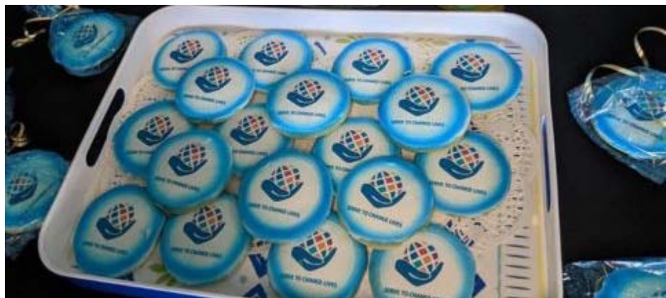
YUM!!! Rotary Themed Cookies!!